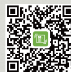
IOS QR Code