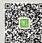
Android QR Code

D2 Tabletop Terminal is specially designed for table or counter use (80-140cm). With fingerprint sensor placed on top of terminal, it enables all-directional fingerprint reading for the convenience of attendance. BioID high sensitivity fingerprint sensor provides faster and more accurate fingerprint verification. With built-in detachable battery lasting for up to 8 hours, and micro-USB power supply for power bank (minimum 2A) connection, there are no more worries for lacking power sockets supply.